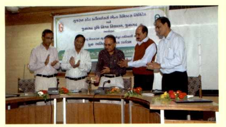
Training programme jointly organized by GSFC and Junagadh Agricultural University during December 26-27, 2012

Training Programme for Progressive Farmers from Amreli District was organized by JAU, Junagadh during December 28-29, 2012 at SSK, JAU, Junagadh. Total 40 farmers of Amreli district gained knowledge about animal husbandry, IPM, vegetable crop cultivation and latest technologies in agriculture for quality production.