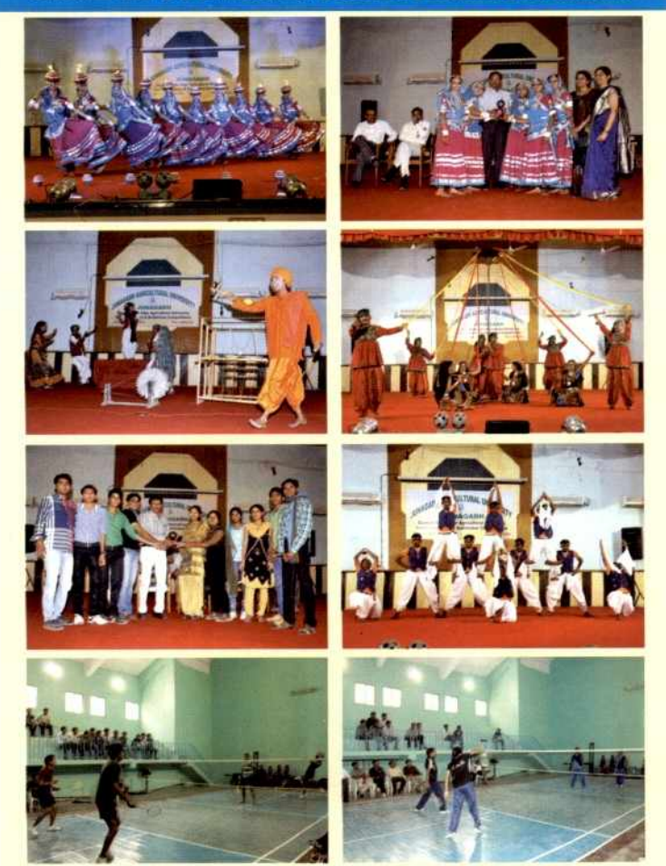
Students performing various cultural acts during "Gujarat State Inter Agricultural University Cultural-Literary & Badminton competition" during November 6-7, 2012